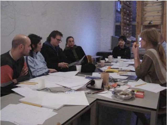
"Programming for Cities" Workshop by socialfiction