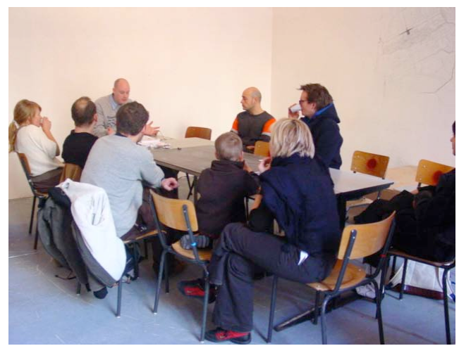
"Programming for Cities" Workshop 3 December 3 pm