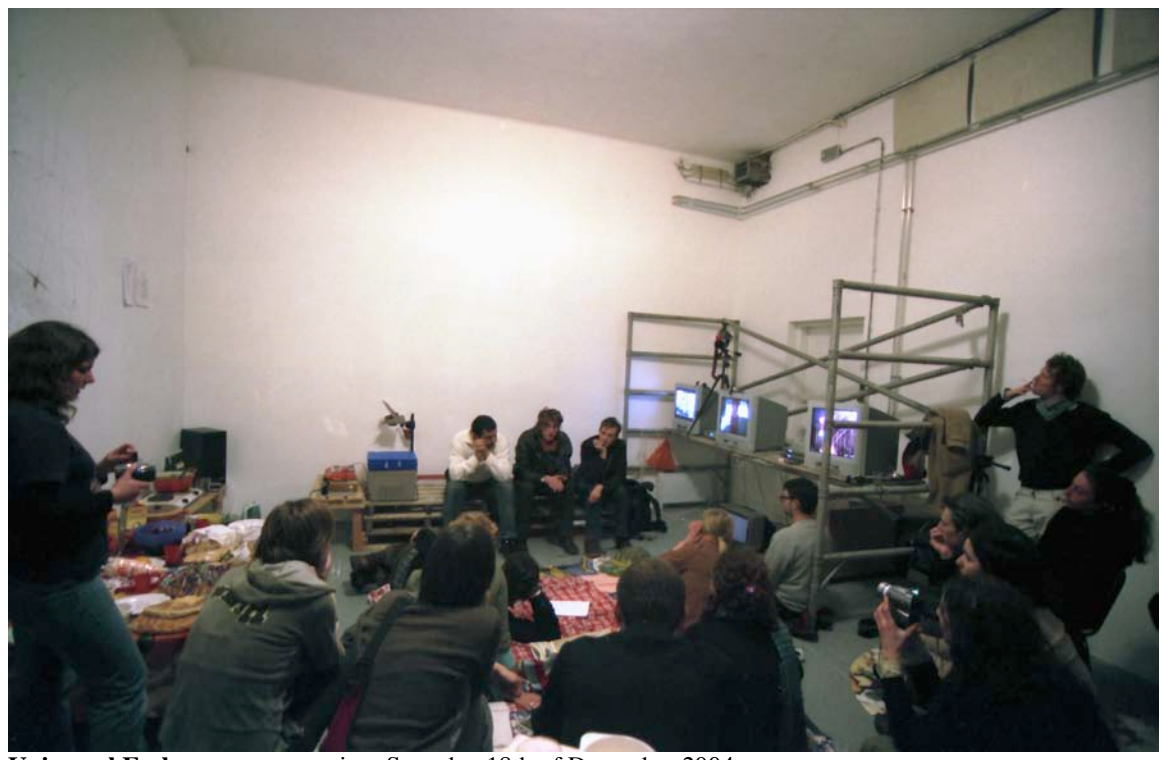
Universal Embassy - presentation, Saturday 18th of December 2004