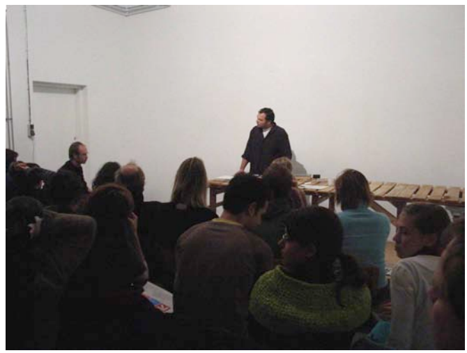
Sunday 21. November 2004 Buro MAAN work presentation