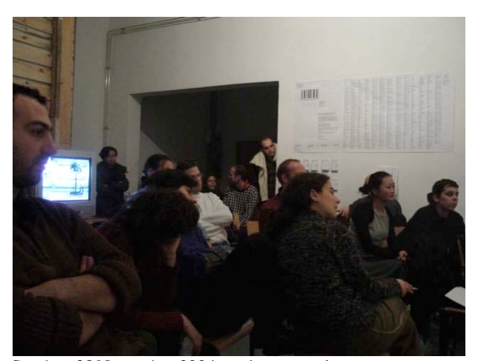
Sunday, 28 November 2004 workpresentations