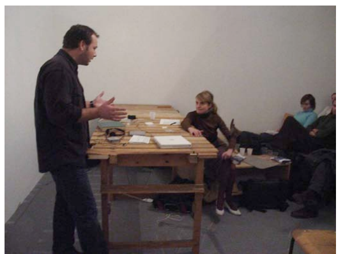
Sunday 21. November 2004 Buro MAAN work presentation