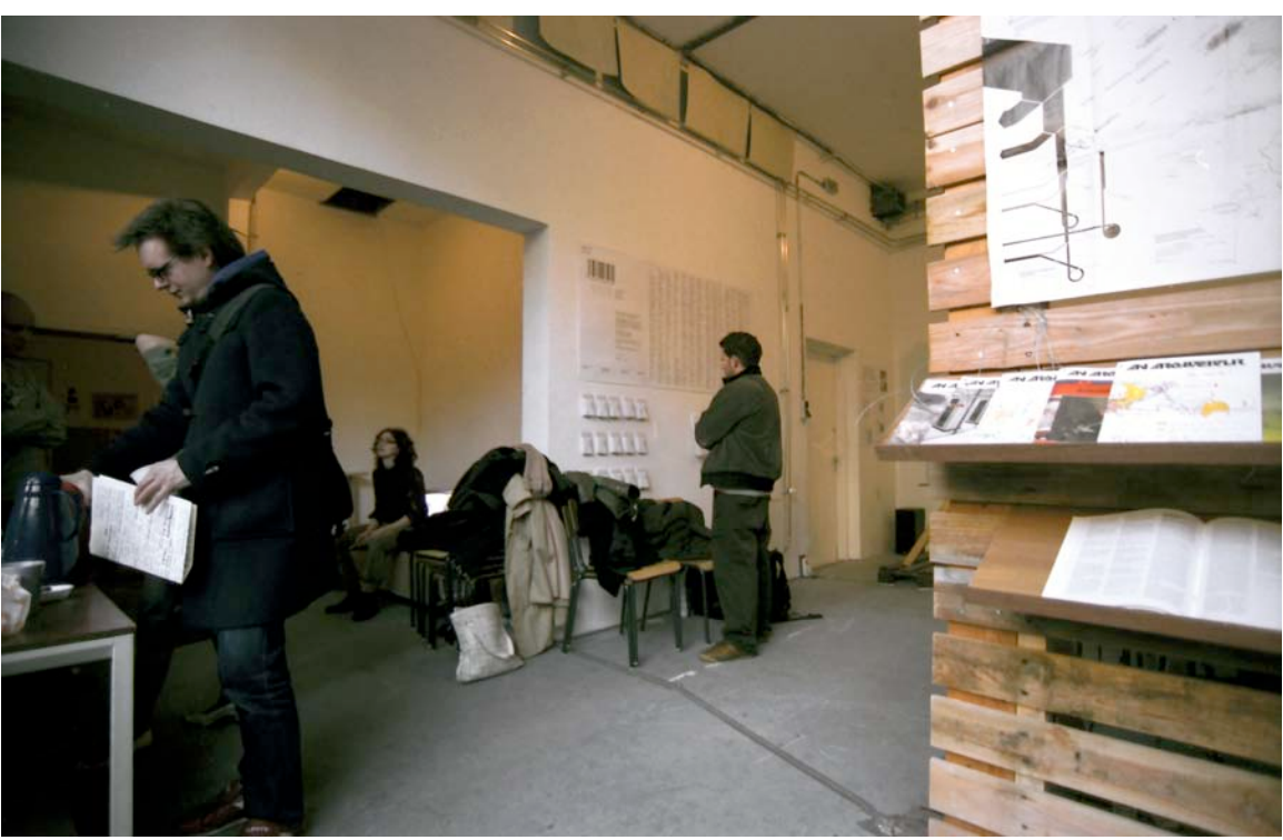
Public Space With A Roof 2005