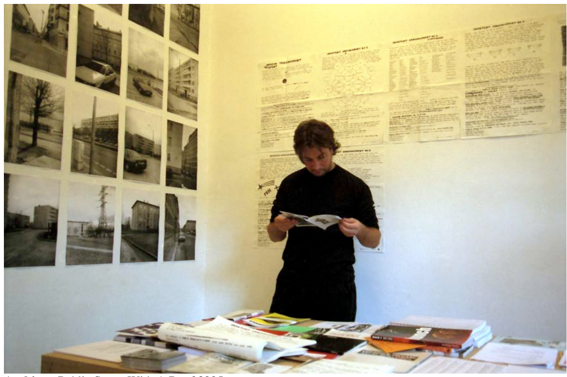
Archive - Public Space With A Roof 2005