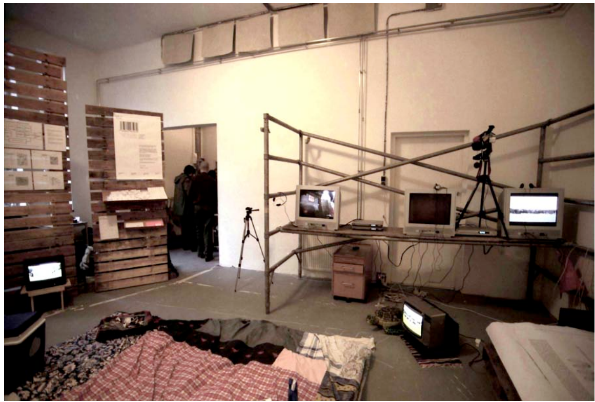
UNWETTER - discursive picnic on Saturday 18th of December 2004