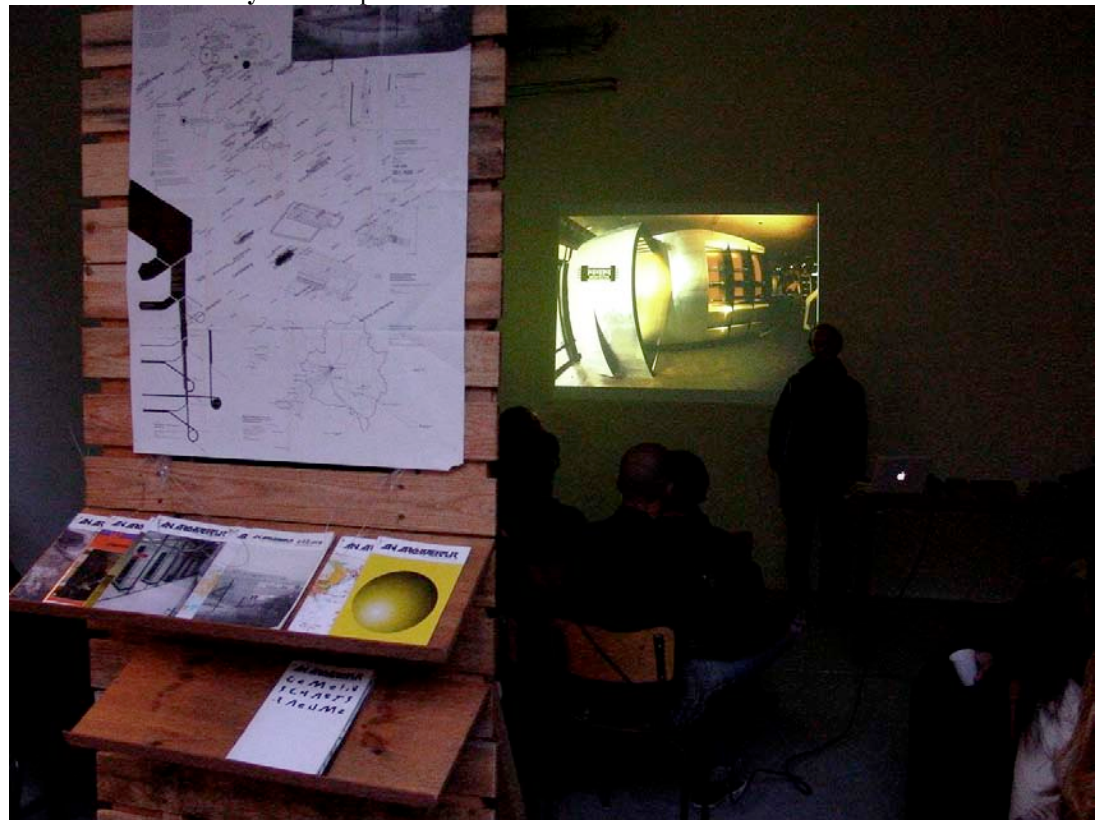
2012 architects (Rotterdam) work presentations Sun. 14 November 2004