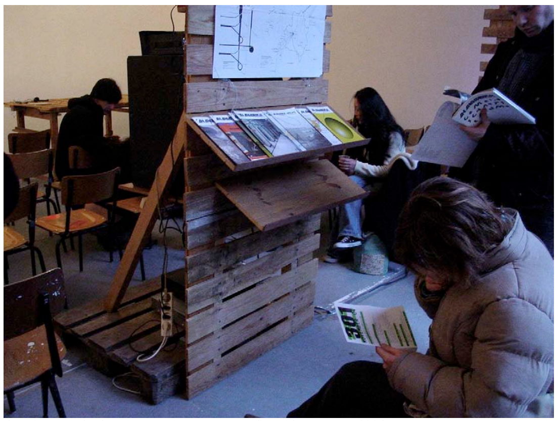
Architecture As Analyses work presentations Sun. 14 November 2004