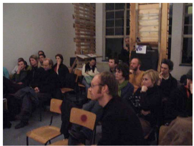
Sunday 21. November 2004 Buro MAAN work presentation