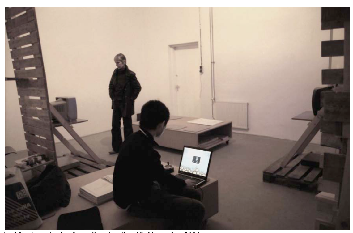
Architecture As Analyses Opening Sat. 13. November 2004